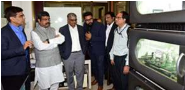
Hon Minister of Petroleum & Natural Gas, India, Shri. Dharmendra Pradhan visits Bioprocessing Laboratory at IIT, Bombay co-funded by Praj