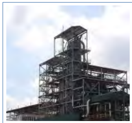
Ingenio Risaralda S.A.