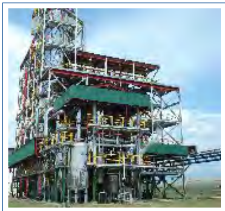
Ingenio Mayagüez S.A.