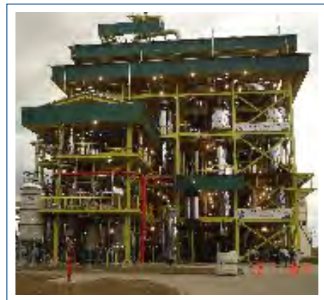
Ing. Providencia S.A.