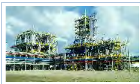
Destileria Riopaila S.A.